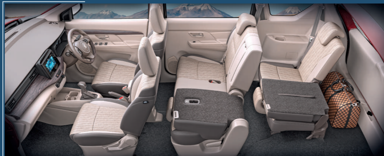
Smart Flexi Seating with 2 nd & 3 rd Row Recliner Seats Spacious and smart with 2 nd row one-touch recline & slide for easy 3 rd row access.