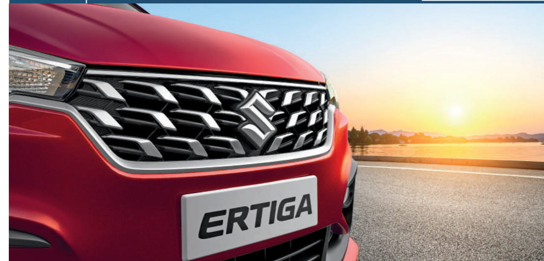
Dynamic Chrome Winged Front Grille The most stylish way to make an entrance.

Elegant from every angle, the Ertiga is designed to bring out the stylish side of togetherness.