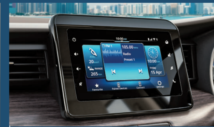
17.78cm Smartplay Pro Connect with your world with just a voice command - "Hi Suzuki".