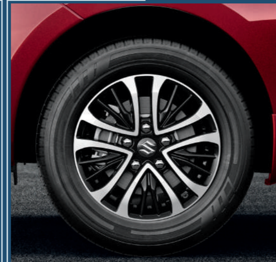
Machined Two-Tone Alloy Wheels Make a statement, every time.