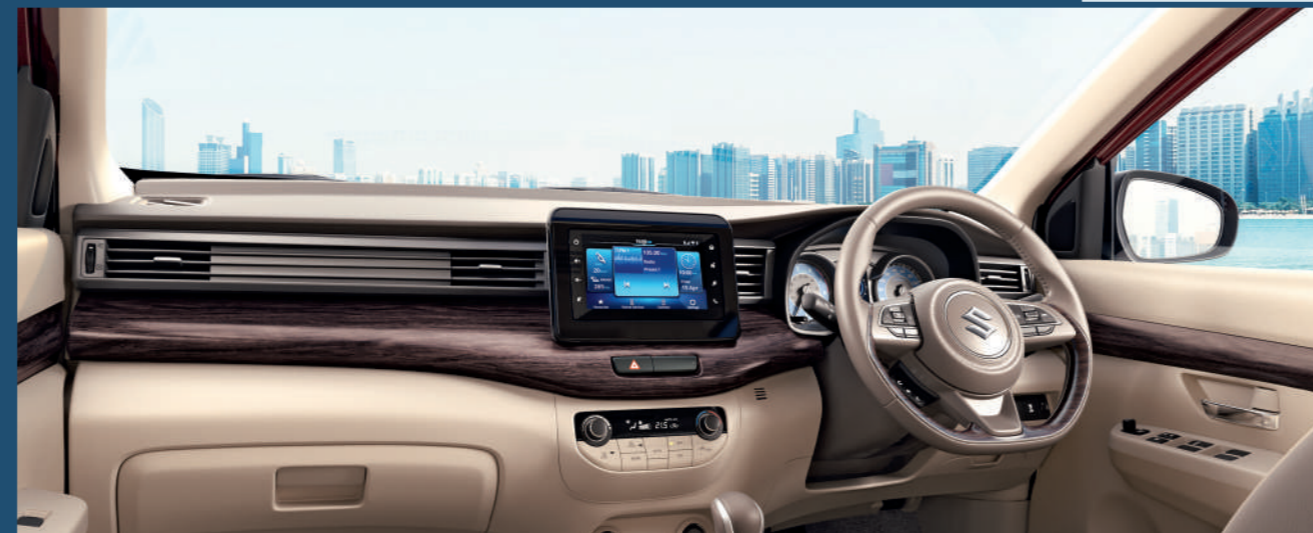
Sculpted Dashboard with Metallic Teak-Wooden Finish Get welcomed by elegance every time you step in.

Space and sophistication blend perfectly inside the Ertiga.