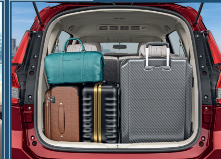
Large & Flexible Boot Space A lot can go in before you do.