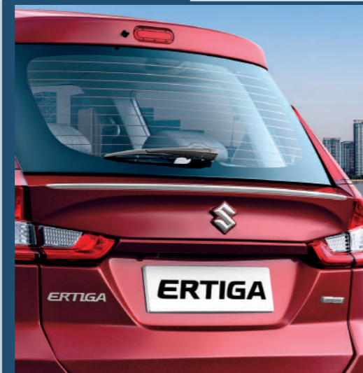
New Back Door Garnish with Chrome Insert Let those second looks chase you.