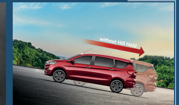
Hill Hold Technology Prevents the car from rolling back momentarily.