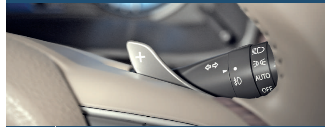
6-Speed AT with Paddle Shifters Surge ahead by engaging the smart paddle shifters.

Togetherness, driven by technology. The Ertiga is equipped with state-of-the-art technology to add more fun to your moments of togetherness.