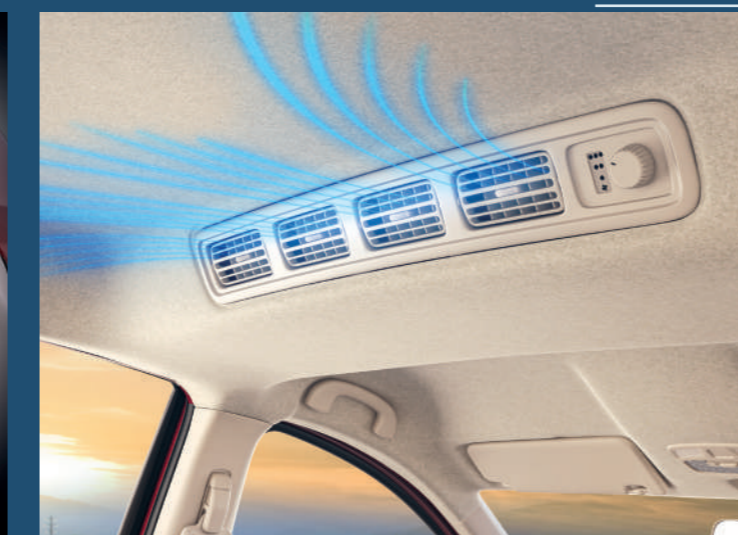
2 nd Row Roof-Mounted AC A cool experience for all with 3-Stage Speed Control.