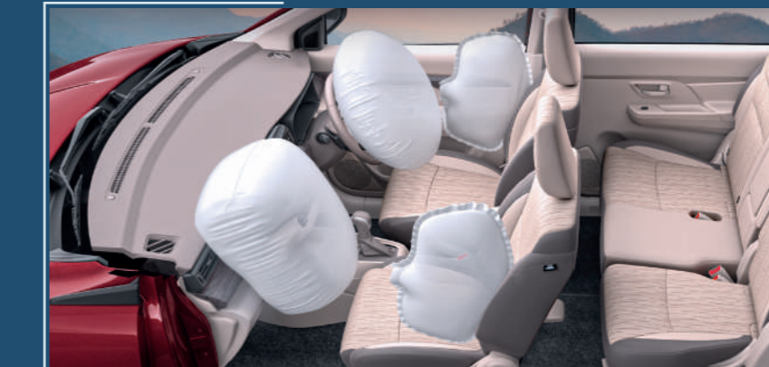
Quad Airbags Enhanced safety for everyone.

The reliable and proven Heartect Platform coupled with Quad Airbags in the Ertiga are engineered to cocoon every passenger in complete safety and peace of mind.