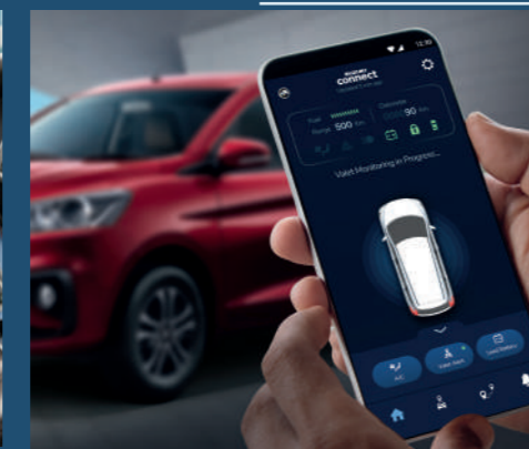
Connected Car Technology with Suzuki Connect Always stay connected with your car.